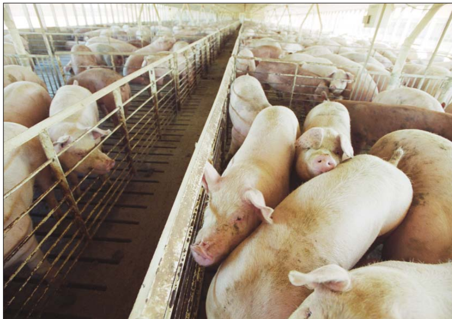
Crowd control. Changes in pig farming, including the rise of large farms, may be spurring the evolution of new swine flu viruses.

The structure of the influenza virus lends itself to such radical changes. The virus is made of eight single-stranded segments of RNA that together code for 10 proteins (see illustration). If two or more different viruses infect the same host cell, they can swap segments, creating new viral types.